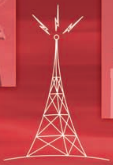
ANTENNA TOWER SITE