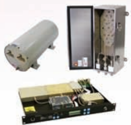
Tower Top Amplifiers