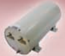
Tower Top Amplifiers