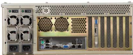
I/O connectors are dependent upon the model selected. See specifications for details.