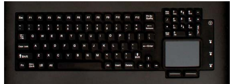
Touch Point Keyboard Option

I/O connectors are dependent upon the options selected. See specifications for details.