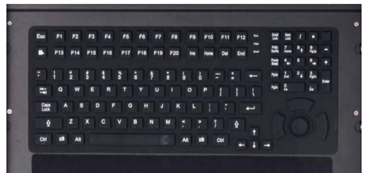
Hula Point Keyboard Option